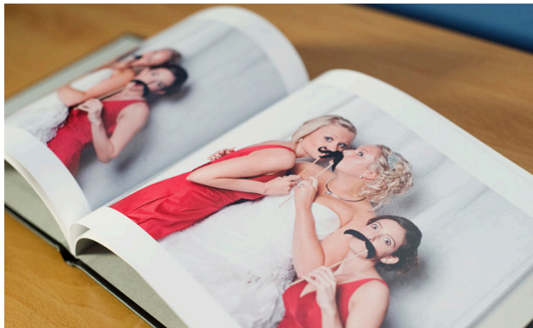
Photo booths are a fun and creative way to capture the personalities of your friends and families on your wedding day. The photo booth setup comes with a white wonderland backdrop, full lighting and an iPad viewing station to let guests see their images as soon as they are taken. Your photo booth gallery will be included in your digital files after the wedding, and you'll receive a complimentary book with your favorite photos.